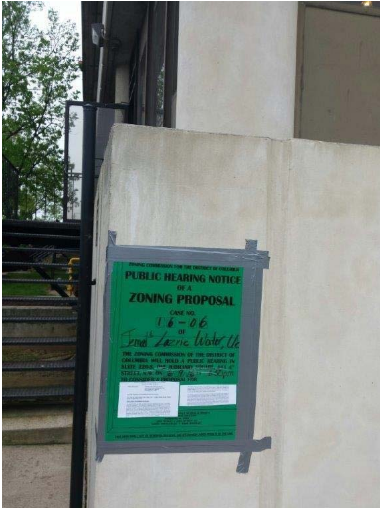
3. ZC 16-06 Reposted 6-7-16 1900 Half Street