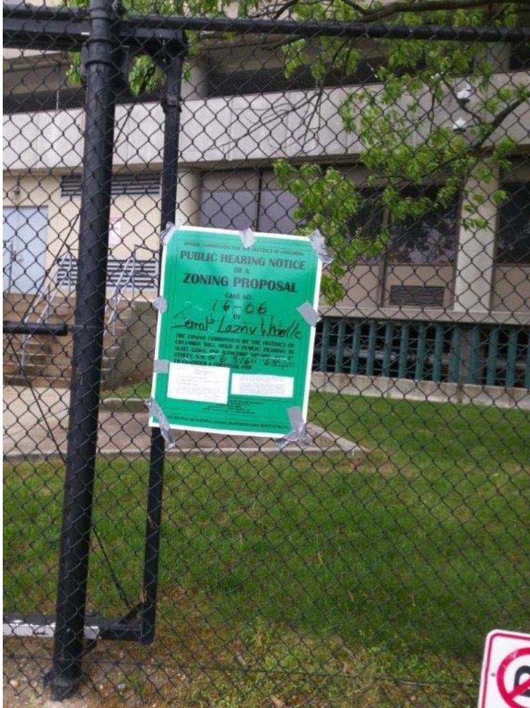
2. ZC 16-06 Reposted 5-18-16 T Street SW