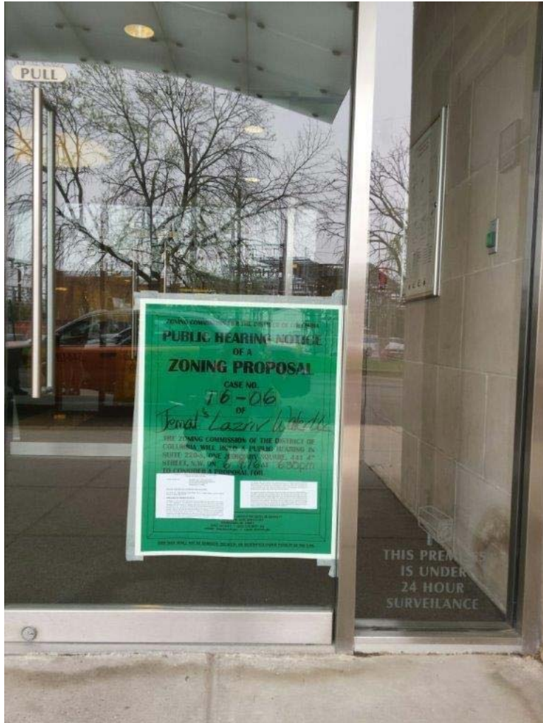
1. ZC 16-06 Reposted 5-18-16 - 1900 Half Street SW